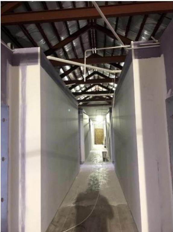
Interior Build out and Wall Priming in Progress