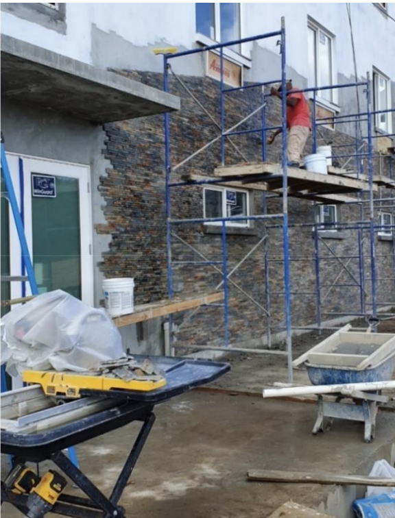
North Elevation Stone Tile Cladding in Progress