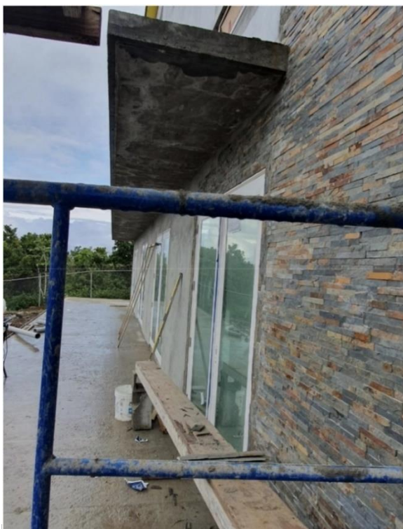
Stone Tile Cladding in Progress