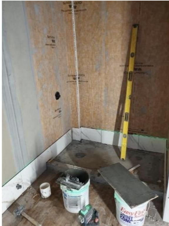
Schluter KERDI Waterproofing Membrane Installation in Progress