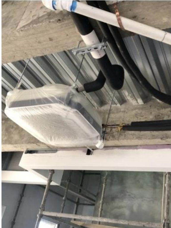
Installation in Progress