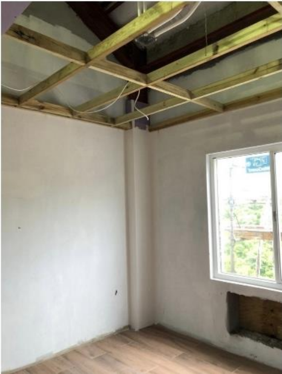
A/C First floor interior wall priming and ceiling framing