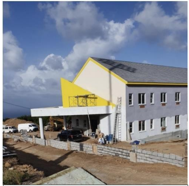
West and North Elevations Painting in Progress