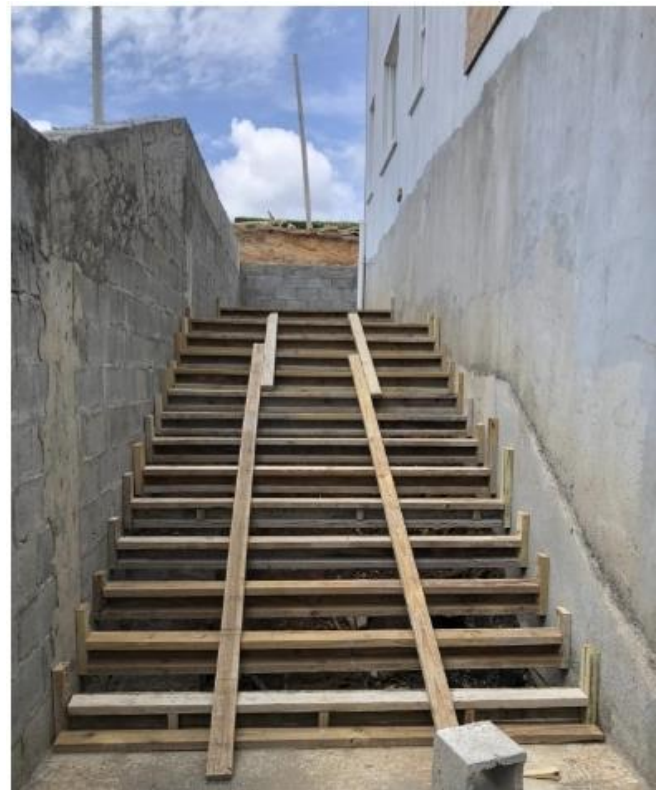
South external works near Completion