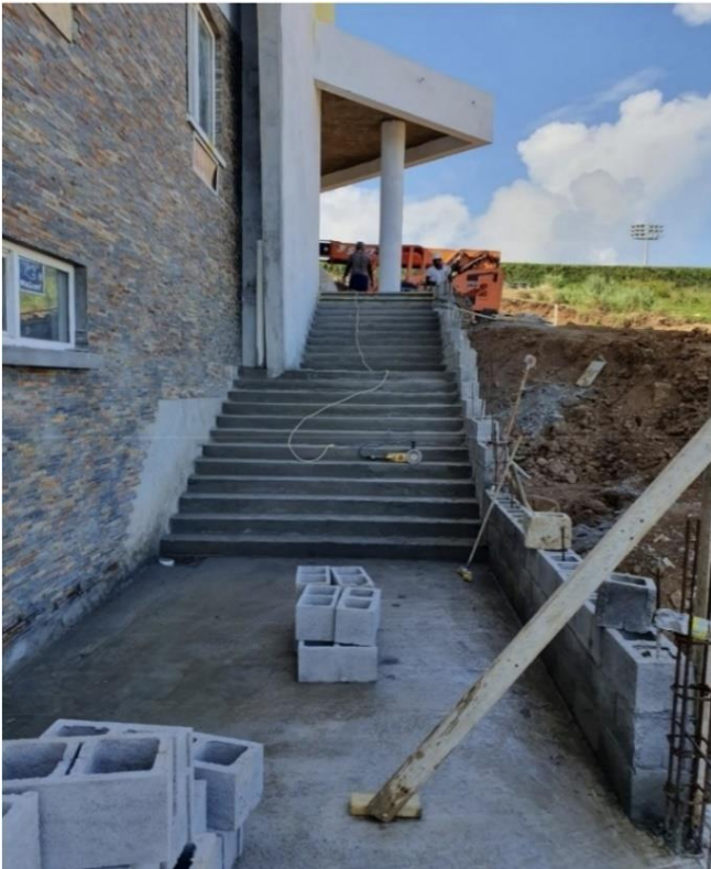
North External Works in Progress