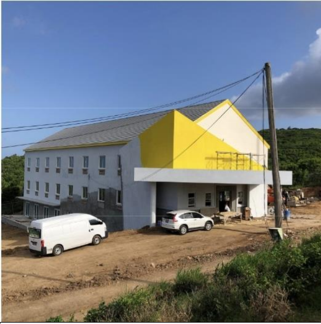
South Elevation Finish painting in Progress